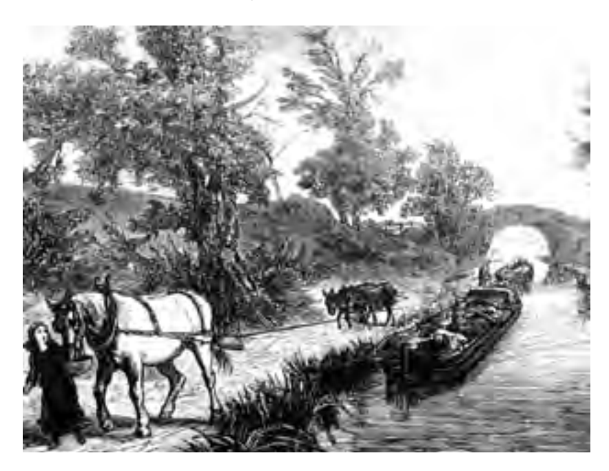
An early nineteenth-century drawing of canal barges.

22 Study the picture, and then answer the questions which follow.